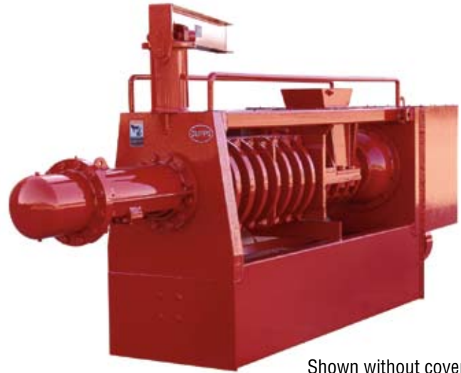
Shown without covers.

Produces meal that is higher in protein and lower in fat, with greater throughput.