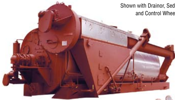
Shown with Drainer, Sedimentor, and Control Wheel.

Up to 4,400 square feet of heat transfer surface.