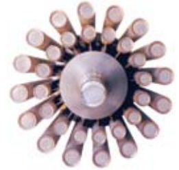
End view of tube-type Supercookor shaft.