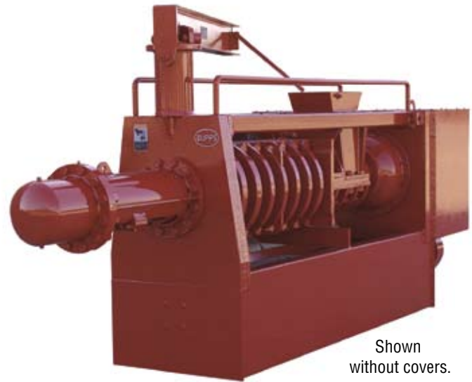
Shown without covers.

Long service life and low maintenance costs.